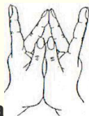
Illustration of Mudra

Golden Mother Mudra : Interlace the fingers of both hands inwards; place the middle fingers upright touching and point the index fingers apart. Touch the thumbs lightly against the middle fingers (hold the mudra in front of your chest.)